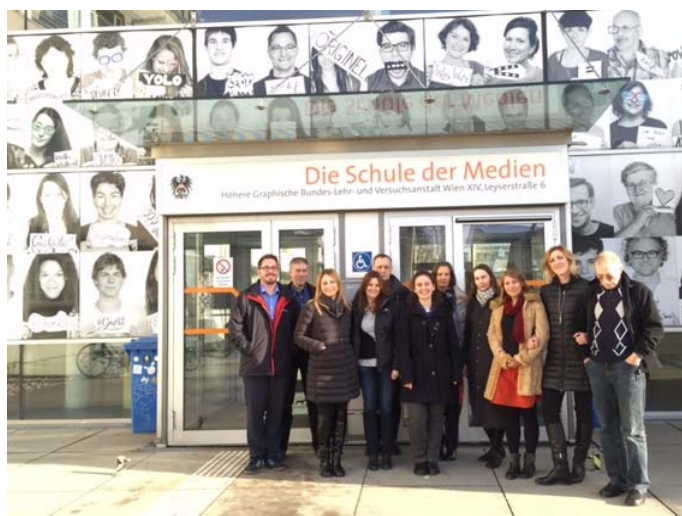
Kick-off meeting in Vienna, December, 10th and 11th 2015

Partners were welcomed by E-learning concept representatives in December 2015. This kick-off meeting was organized in tight collaboration with the college Grafische (www.grafische.net) of Vienna. Thereby a study visit was organized in order to discover the good practices implemented by the college (use of ICT in educational supports, multimedia resources,...). Partners had the opportunity to exchange with students and representatives of the college on the project topic and moreover they planned to produce a project presentation video during the second day of the meeting. Students have interviewed all E-Cal consortium members and are working on the video post-production.